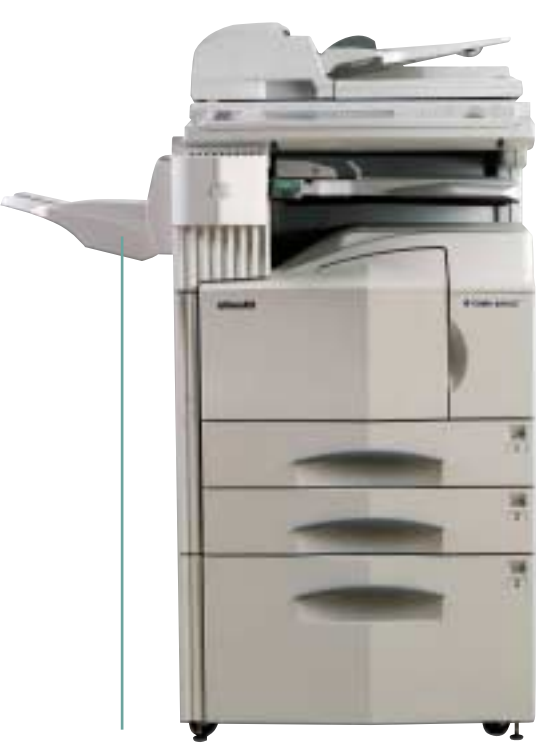
\ensuremath{\mathsf{DF}}\xspace 78, an optional finisher that saves on costs and space