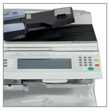
ADJUSTABLE TOUCH-SCREEN PANEL with intuitive menu