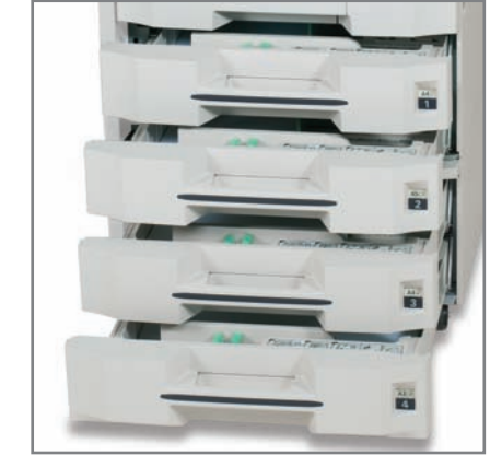
4 UNIVERSAL CASSETTES for a maximum paper capacity of 2,200 sheets