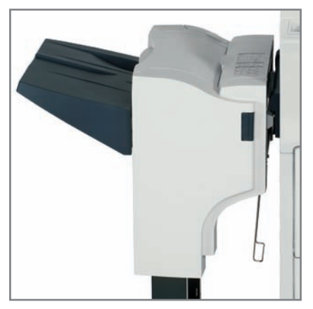
DF-730 FINISHER with a 1,000-sheet output capacity tray

Options for the high-end configuration include two additional 500-sheet paper trays, for an impressive overall capacity of 2,200 cut sheets (with by-pass), plus two different finishers , one, with a 500-sheet capacity, partly incorporated within the body of the machine, the other an external unit with double the capacity. Both finishers provide stapling of up to 30 sheets with one staple.