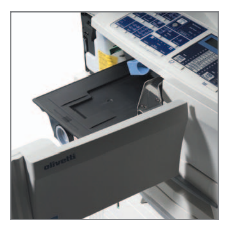
Long-life TONER CARTRIDGE (up to 15,000 A4 pages with 6% coverage)

Efficiency , reliability and cost-effectiveness are the distinctive features of these copiers. The Olivetti d-Copia 1600 and d-Copia 2000 digital copying systems use long-life accessories like a 150,000-copy Drum and 15,000-copy Toner to minimise print cost per page and extend maintenance cycles , for lower cost of ownership.