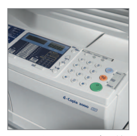
Easy-to-use OPERATOR PANEL for quick access to all digital functions

The two d-Copia models are just as impressive on ergonomics. Not only are they the most compact models in their product category, they also provide a broad operator panel and intuitive user display that lets users work from their desks.