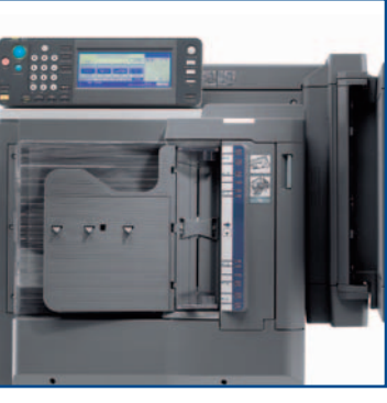
AUTOMATIC 100 sheet PAPER FEEDER