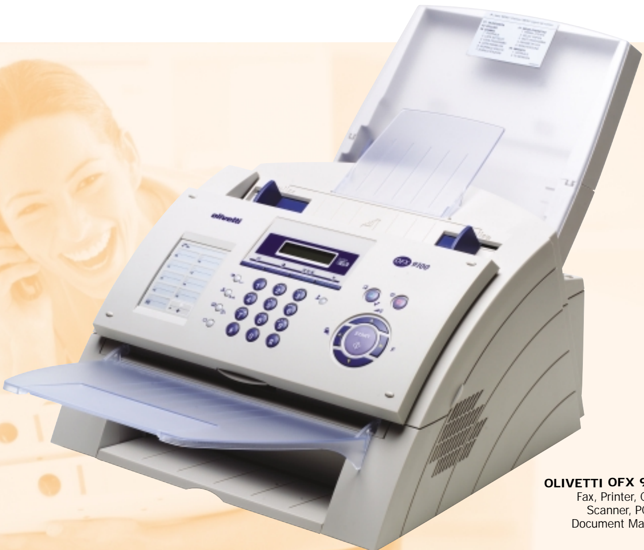
OLIVETTI OFX 9100 Fax, Printer, Copier Scanner, PC Fax, Document Manager