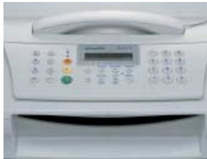
built-in digital answering machine on the OFX 570