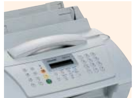
high-quality printing with ink-jet technology